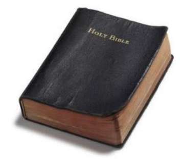
The Bible is the Word of God